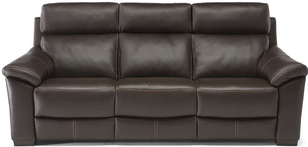
■ Vers. 355