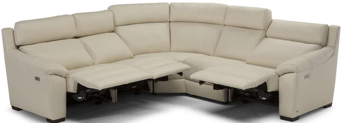
■ Vers. 514+552+029+001+515