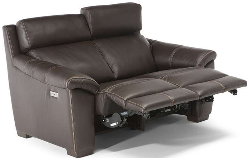
■ Vers. 393