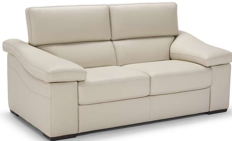
■ Vers. 005