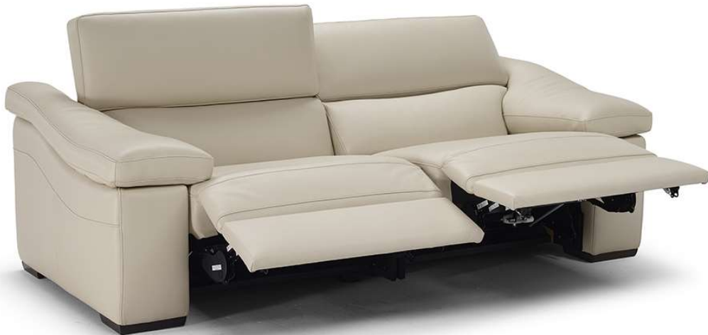
■ Vers. 446