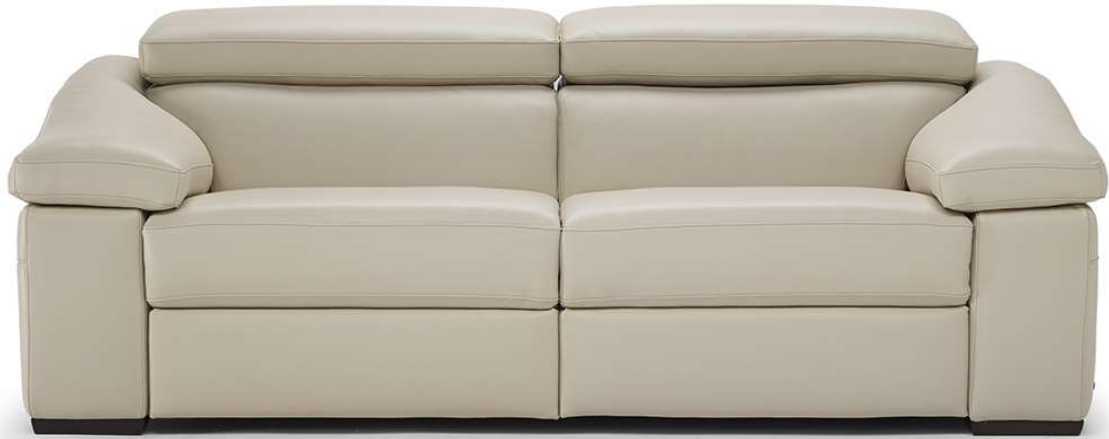
■ Vers. 446